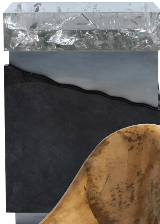
The ice cracked resin sink of the Teran bathroom vanity can be illuminated.