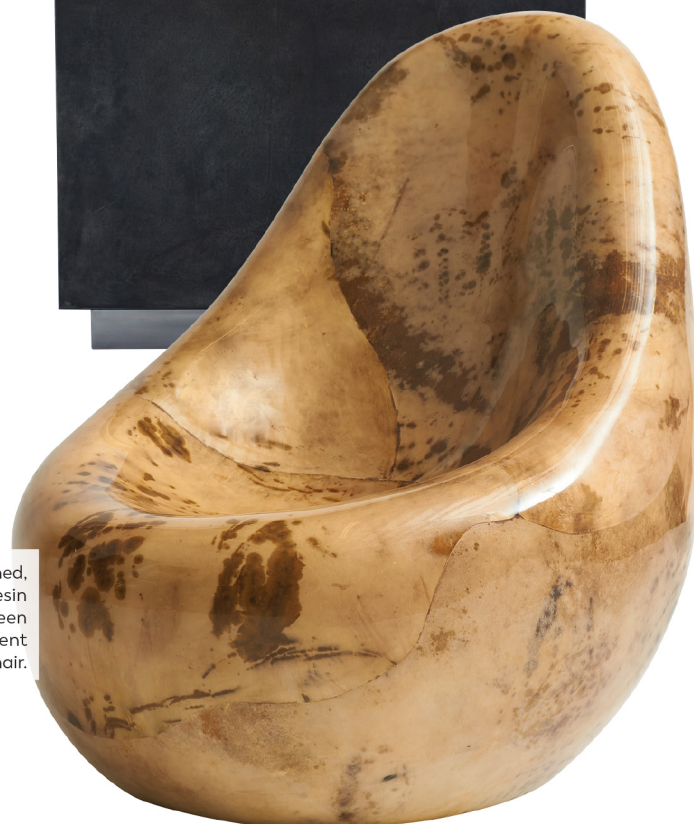
A handpolished, high-gloss resin topcoat adds sheen to the Parchment Egg chair.