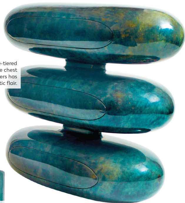
The three-tiered Touche chest of drawers has futuristic flair.