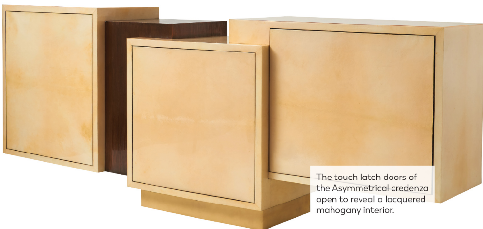
The touch latch doors of the Asymmetrical credenza open to reveal a lacquered mahogany interior.